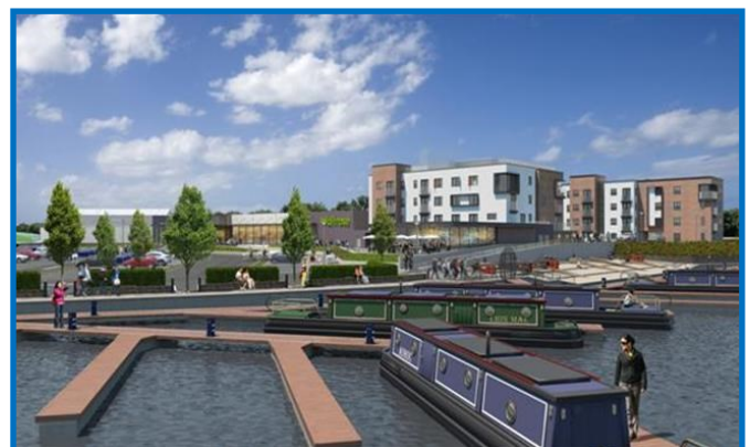
Leedham Court, Hedben Bridge