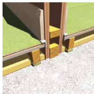
Internal Wall Junction (Loadbearing)