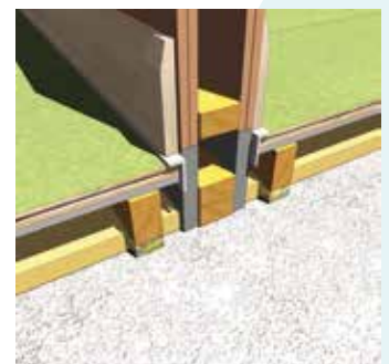
Internal Wall Junction Loadbearing (Rip Liner alternative detail)