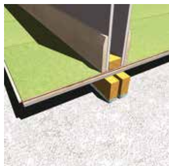
Support of Non-Load Bearing Partitions