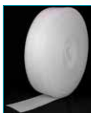
JCW White Edging Strip