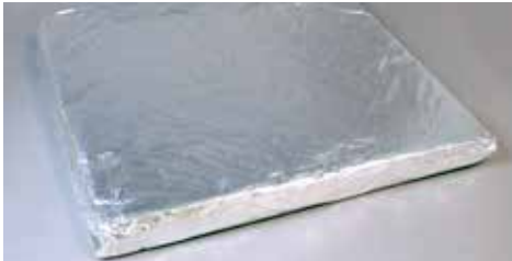
Product Code: 1182 - 600x600x50mm