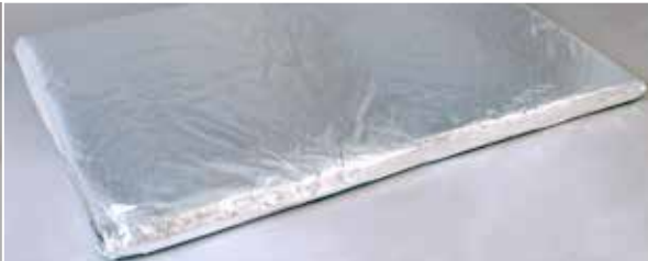
Product Code: 1330 - 1200x600x50mm