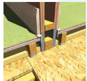
Internal Wall Junction Loadbearing (Rip Liner alternative detail)