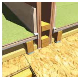
Internal Wall Junction (Loadbearing)