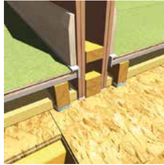
Internal wall Junction (Loadbearing)